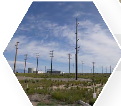
Transmission and distribution lines at the Critical Infrastructure Test Range Complex at INL.

The Sheep Fire at INL posed challenges due to dry conditions and unpredictable winds.